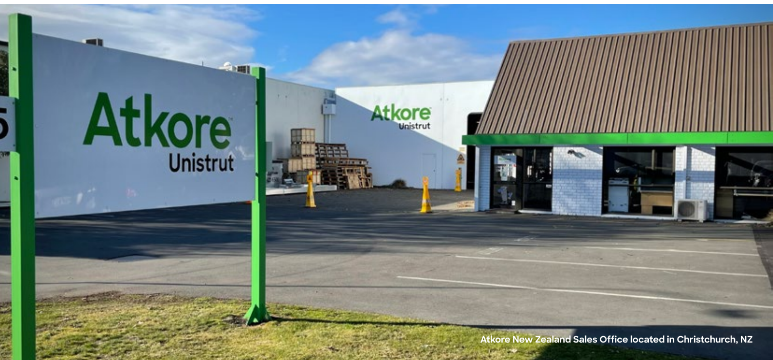
Atkore New Zealand Sales Office located in Christchurch, NZ

Alongside global companies Unistrut and Flexicon, which are well-established brands in Australia and New Zealand, Atkore is poised to become a major player in the market.