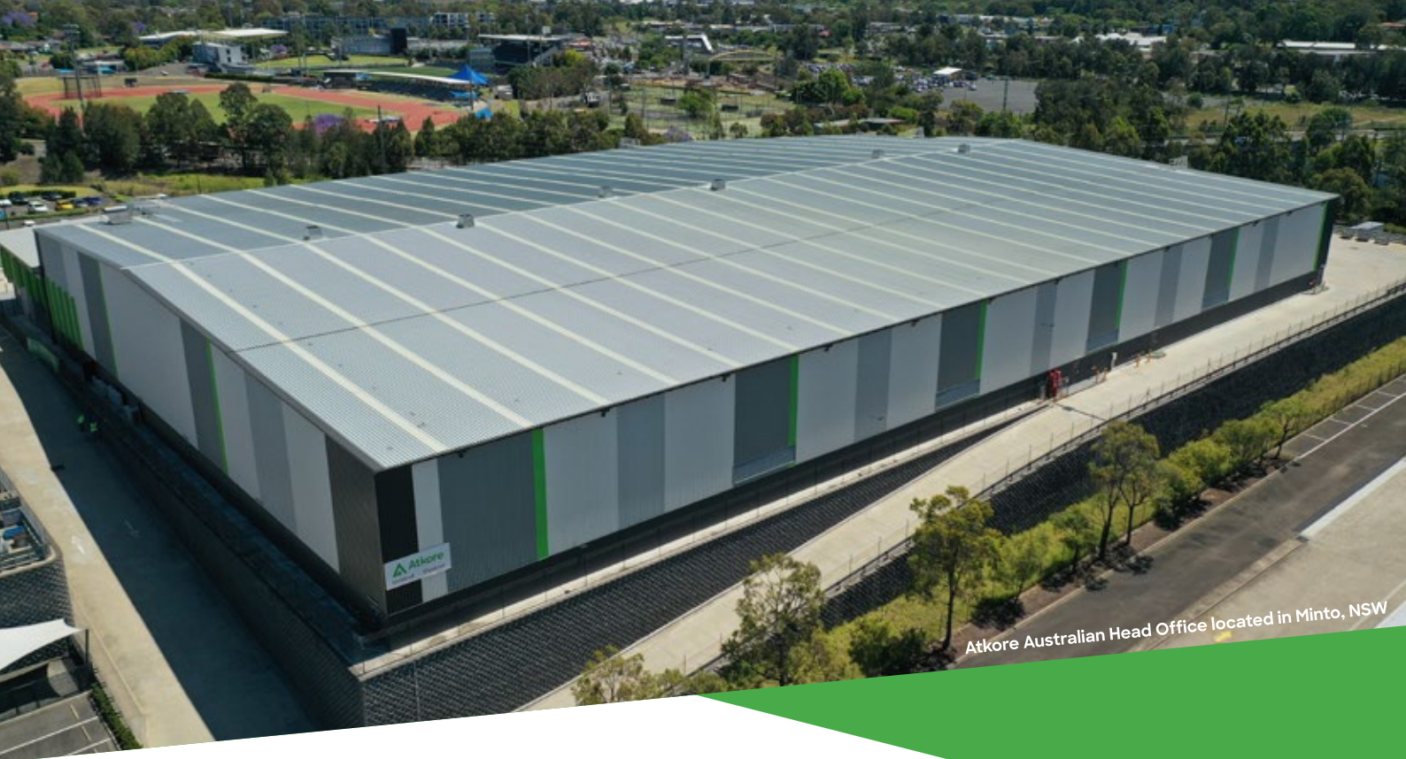
Atkore Australian Head Office located in Minto, NSW